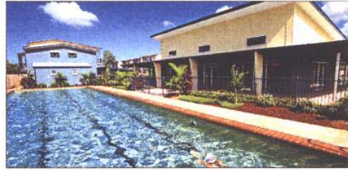
ABOVE: A cool place to exercise