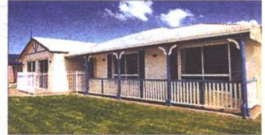
RIGHT: One of the display homes