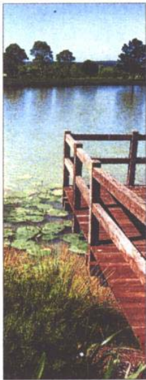
Lake Ellerslie will cover about four hectares.

Helen Dunne 0409 392 843 LJ Hooker Project Marketing onsite sales office: (07) 3200 2477